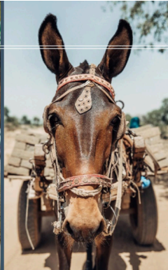
Left: Horses enjoying fodder at India's Equine Fairs Right: A hardworking mule in India's brick kilns, hauling the day's labor.