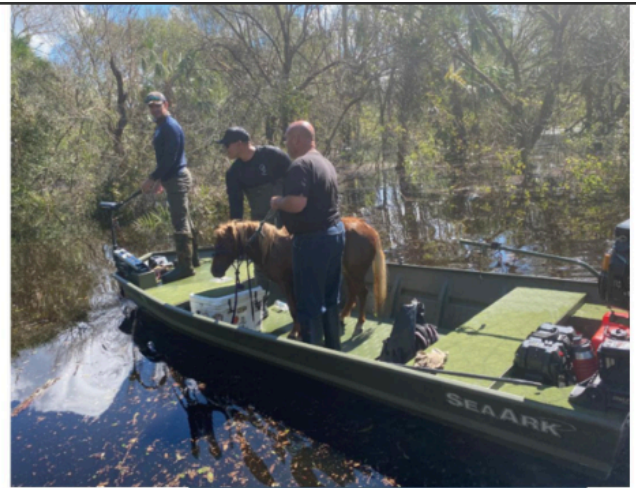
A miniature horse being rescued from flooding in Sarasota County.

Brooke USA relies on supporters to make a difference. With numerous ways to get involved and donate, it is easier to assist such an important cause. To learn more about how you can contribute to Brooke USA, please visit brookeusa.org/donate . ☺