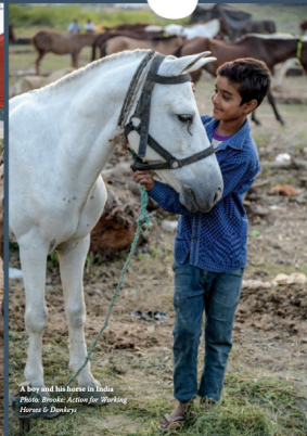
A boy and his horse in India

In the developing world, it is the unsung equine hero that is often the sole source of income for their families through back-breaking labor. One hundred million working horses, donkeys and mules support 600 million of the world's poorest people.